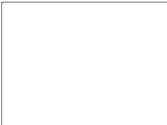
(Mary Woodward, Whitewater Mtn.)

The road up from Retallack was in good shape, and so was the trail. The relatively new trail (bypassing the old trail from the mine, which is on private property) is well built and passes through a nice forest. After about 1.5 km it joins the older trail, which is a bit rougher but still in good shape. The fall colours on the avalanche slopes were beautiful. On reaching a big rockslide at 2000 m, the trail became indistinct. Some of us followed what looked like a recently cairned route across the rockslide, which was rough going. The others took a route further right, below the rockslide and up a steep moraine to the original horse trail; this proved to be the better route. From here, things were pretty much snow-covered, but we were able to follow the trail up to the height-of-land with Cooper Creek at 2200 m. From here we made our way through ankle-deep snow over the moraines, and up to the lake below Whitewater Mtn. Climbing the mountain was obviously out of the question, but we enjoyed the sunny afternoon poking around the giant serpentine boulders, exploring an ice cave at the edge of the glacier, and building a snowman.